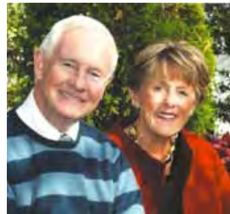
Their Excellencies the Right Honourable David Johnston, Governor General of Canada and Mrs. Sharon Johnston.

The CSPWC has been honoured by the Patronage of the new Governor General of Canada. Sworn in on October 1, 2010, His Excellency the Right Honourable David Johnston is the 28 th governor general since Confederation. This has been a long tradition of the Society and we have to reapply every time there is a change of Governor General.