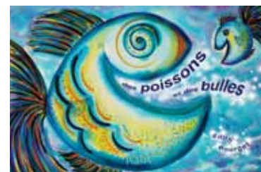
EDITH BOURGET ILLUSTRATES CHILDRENS BOOKS

watercolours: Des poissons et des bulles and Le royaume de Nedji .