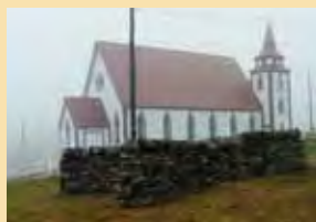
English Harbour Arts Centre

in the former All Saints Anglican Church, a fully restored building that offers workshop and exhibition space with access to splendid outdoor vistas on the Bonavista Peninsula. Please visit www.englishharbourartscentre.com for more information and an application form.