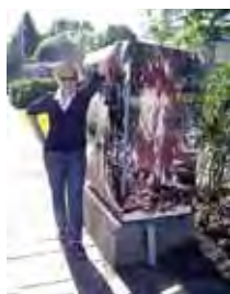
Utility Box design by Gerry Thompson

Art can spring up anywhere. In Port Coquitlam, BC, check out the utility box on the northwest corner of Shaughnessy and Wilson. A large jpg of GERRY THOMPSON's painting, Green Guardian , inspired by a grove of trees at Trinity Western University, was used to transfer the image onto the box.