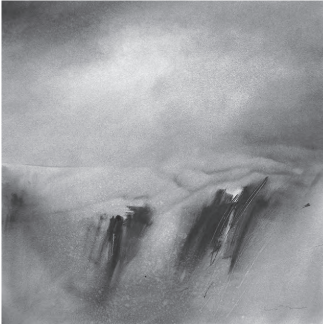
POINT OF TIME - TRACADIE

THE CANADIAN SOCIETY OF PAINTERS IN WATER COLOUR / LA SOCIÉTÉ CANADIENNE DE PEINTRES EN AQUARELLE • MARCH 2009