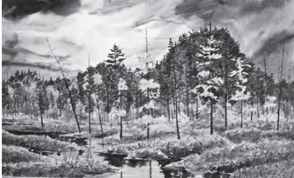
ALGONQUIN SWAMP