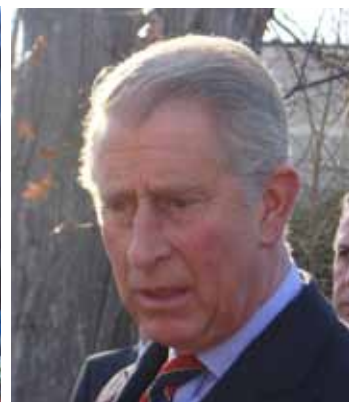
ABOVE: Royal Highnesses the Duchess of Cornwall and the Prince of Wales