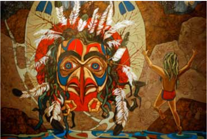
Vision Quest - On becoing a Shaman BY JUNE MONTGOMERY