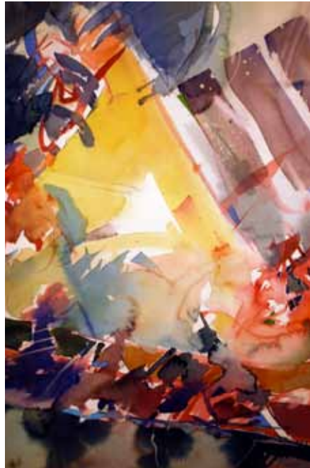
Allegro Spirituoso BY BRENT LAYCOCK