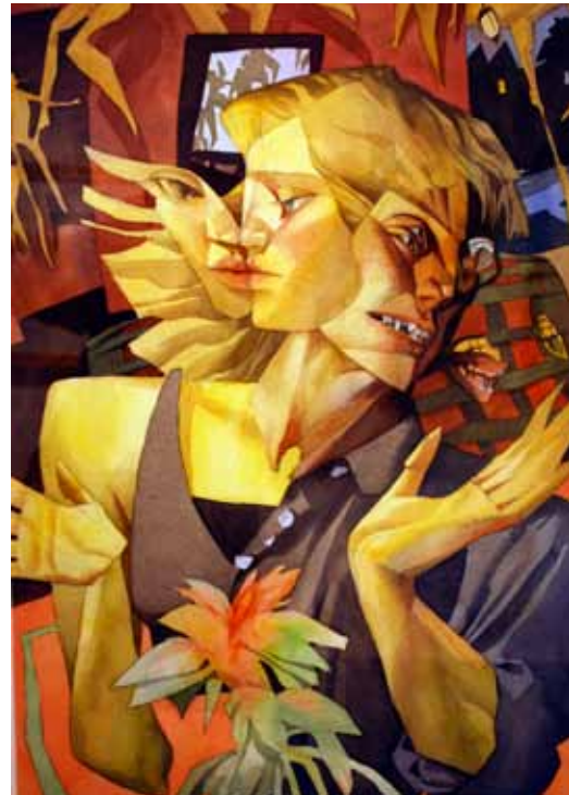
Open House BY RUDOLF STUSSI