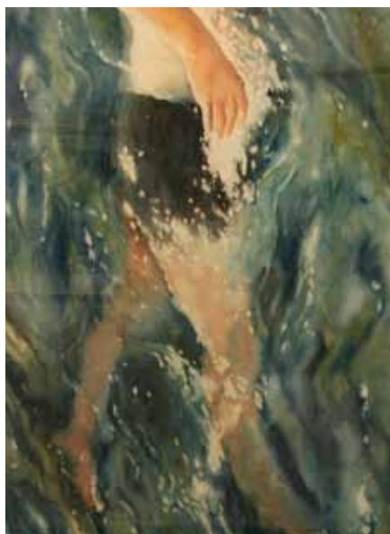
Map of Swimming Through Unknown Water BY LINDA FINN