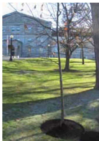
TREE PLANTED BY PRINCE CHARLES AT RIDEAU HALL