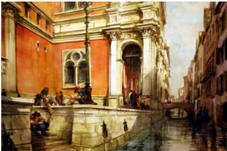
A Moment of Reflection, The Scuola Grande di St. Rocco, Venice BY ANTHONY J. BATTEN