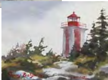
Point Prim by POPPY BALSAR

(Editor's Note: I was only looking for a good article about art and marketing when I contacted Poppy but art is sneaky and dangerous, I ended up purchasing 3 of Poppy's daily paintings and it was a struggle to get to the website in time before the daily paintings were sold. Note also that it is relatively easy to set up a Pay Pal ordering process on a blog or website, which is an essential component of this project.)