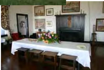
The Gallery "Great Room"

The Leighton Art Centre, Gallery and Museum has become a well-known art venue showcasing a variety of outstanding exhibitions by Alberta Artists. The predominant focus of art, inspired by the landscape, is the legacy the Leighton Art Centre is built upon. The gallery, with 120 running feet of exhibition space, hosts several exhibits throughout the year.