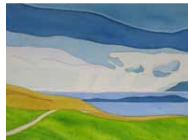
Horizontal Lines Creative Catalyst Award $100 and $250 in video product Gil Cameron CSPWC, Toronto, ON