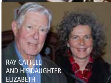
RAY CATTELL, AND HIS DAUGHTER ELIZABETH