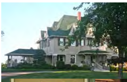
The Hillcrest, St. Andrews

The two weeks sped by in a productive blur of painting, sketching, photographing and socializing in the most beautiful settings imaginable.