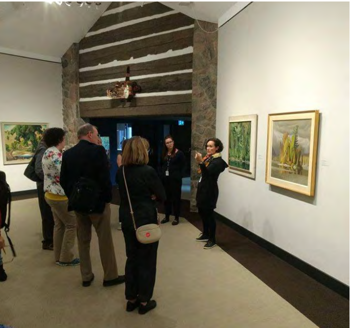
McMichael Gallery visit