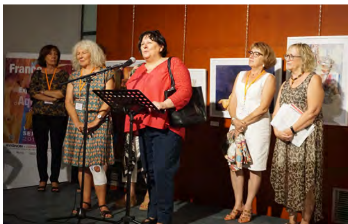
Opening remarks – Mayor Avignon