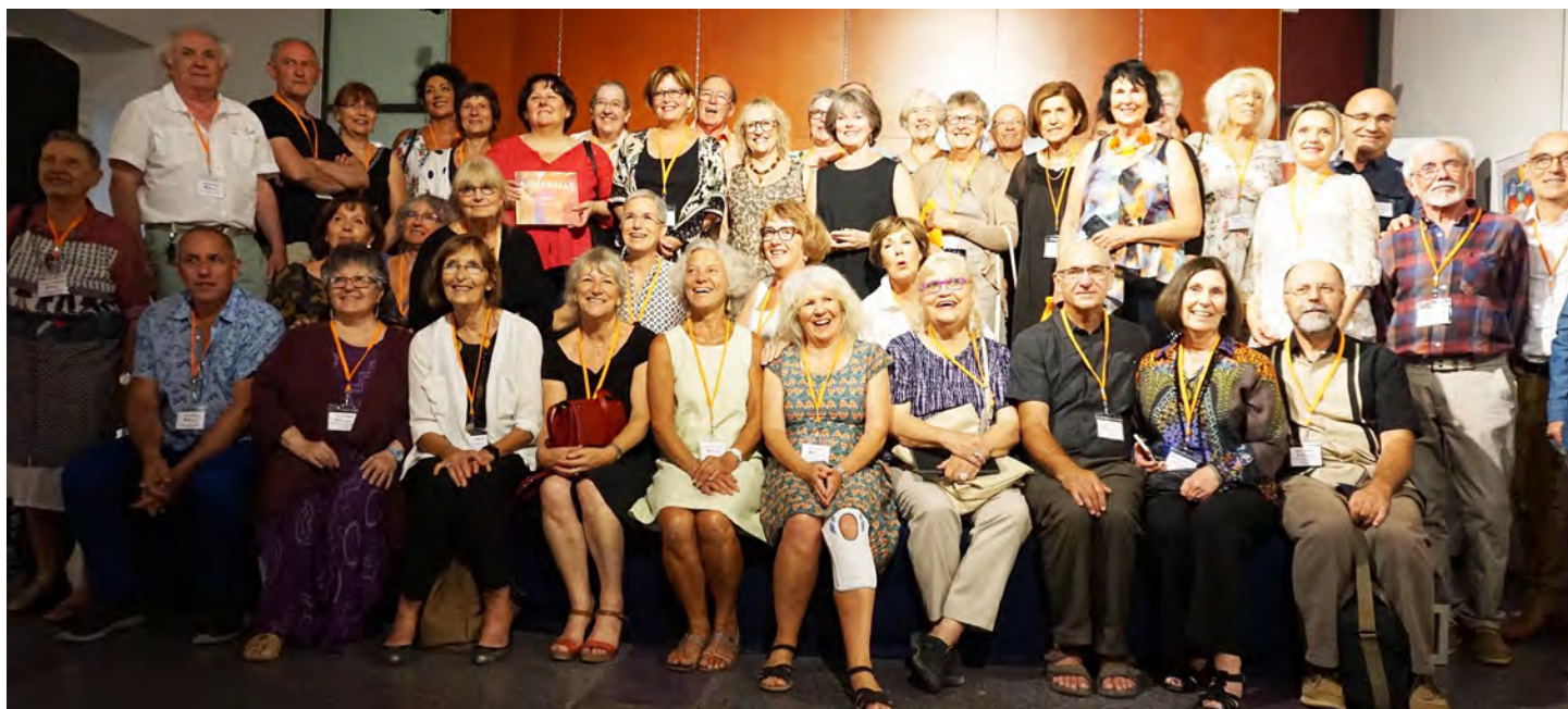
Opening group shot of exhibiting artists