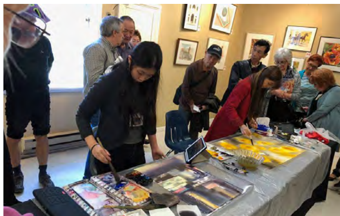
Demonstration at Boynton House opening