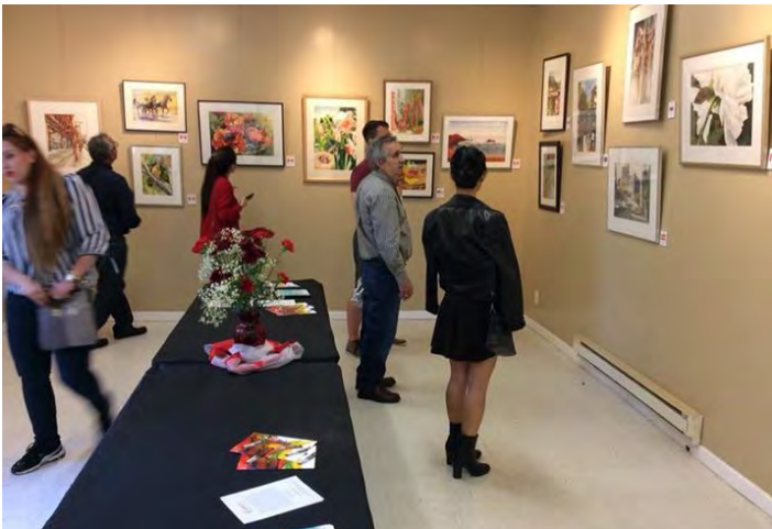
Opening at Boynton House