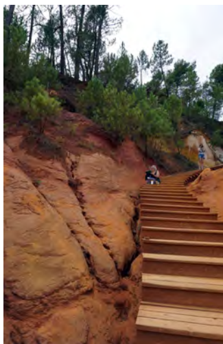
Rayne painting on steps