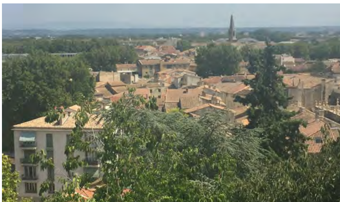
View of Avignon

Squares and shady terraces are friendly places. One stops for a drink, enjoy the show, chat with friends, relax from a long day of shopping.