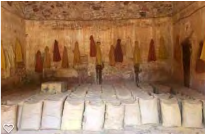
Inside the Okhra Conservatory

Roussillon is located in the very heart of the biggest ochre deposits in the world and is distinguished by a wide palette of flamboyant colours. The conservatory was an ochre quarry, and we were given a tour of how the ochre was collected as well as the many uses of these pigments.