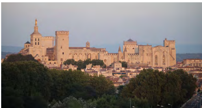
Palace of the Popes

Squares and shady terraces are friendly places. One stops for a drink, enjoy the show, chat with friends, relax from a long day of shopping.