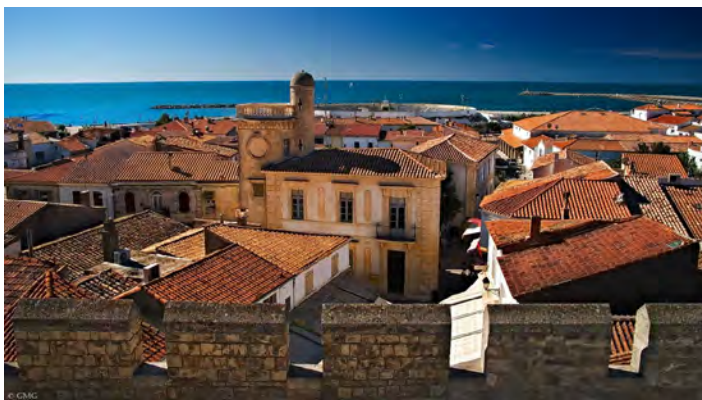
Saintes Maries de la Mer