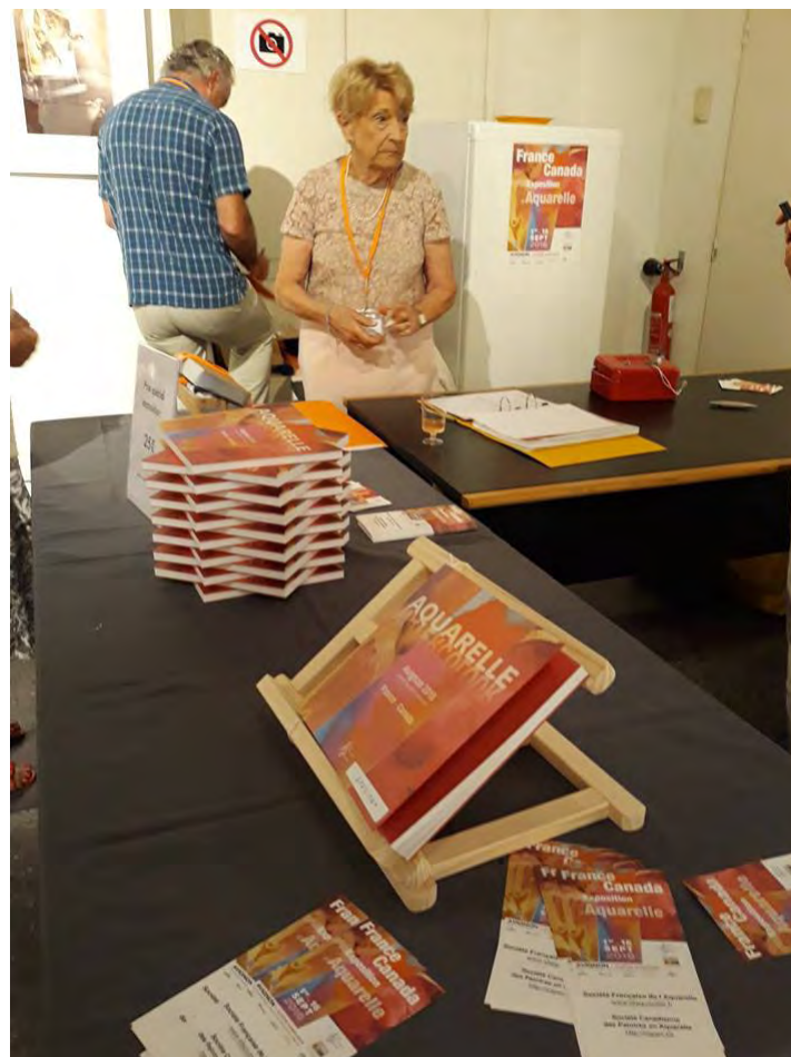
Sales of catalogue at opening