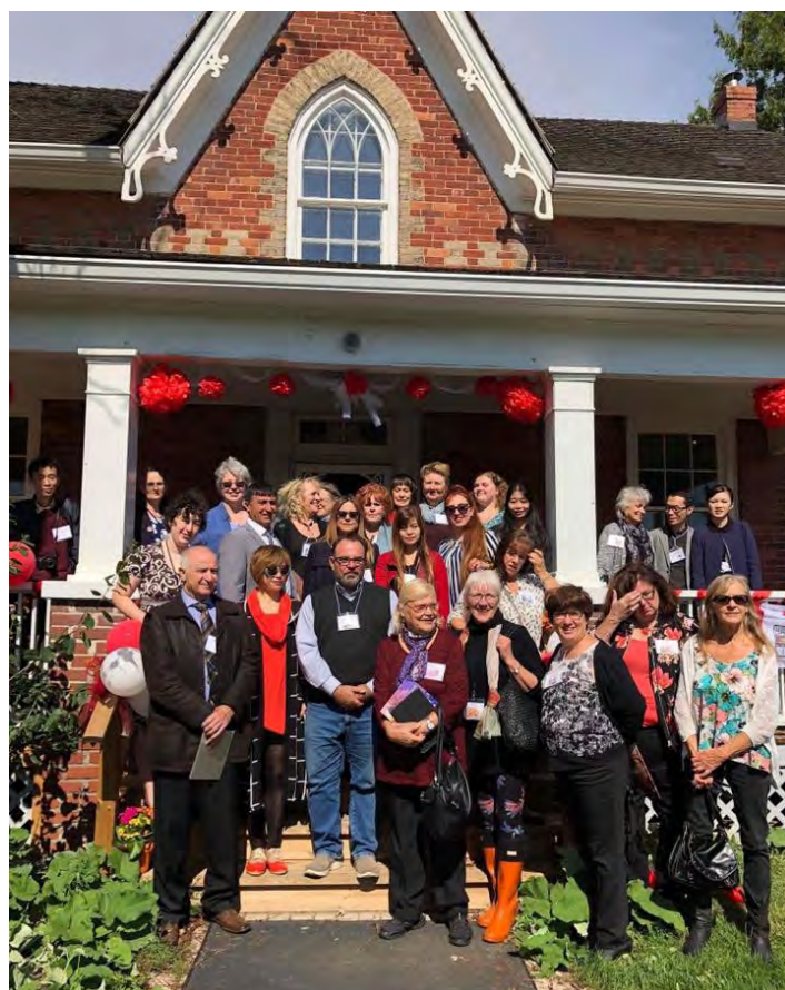
Group shot of artists at Boynton House