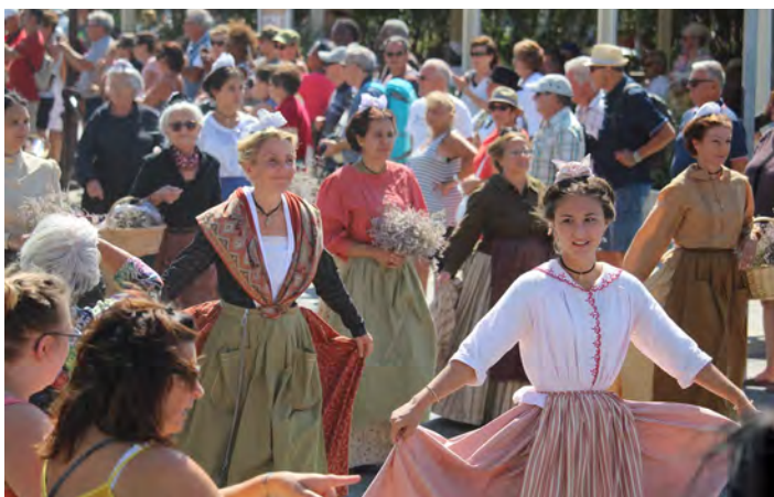
Folk dancing in the street